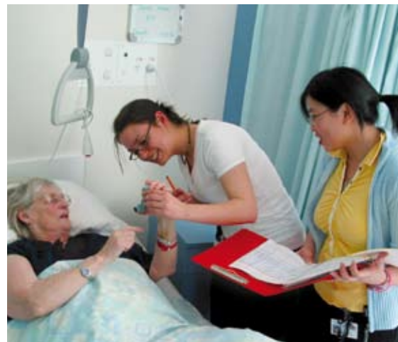
Pharmaceutical advice provided to client by Pharmacy students during clinical rounds

The use of medication is the most common action taken by people with asthma. Regular use of inhaled corticosteroids or 'preventer medication' can reduce asthma symptoms and prevent severe episodes of worsening asthma. Despite the obvious benefits of preventer medication, roughly only one