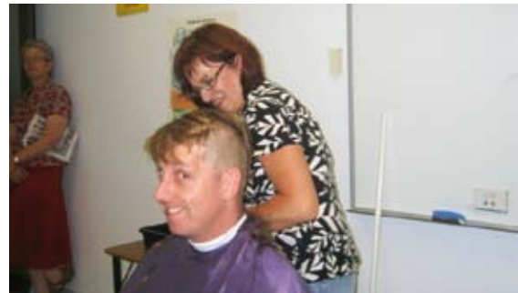
Murray with a new look