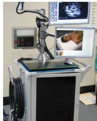
Specialist's view of an ECHONET trolley during a remote echocardiogram examination