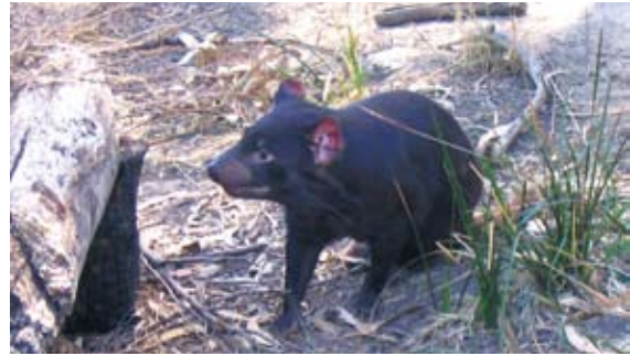
Cedric the Tasmanian Devil who may hold the key

Further analyses, with collaborators from the University of Sydney, has uncovered a greater genetic diversity in the Western population than the Eastern (diseased) population