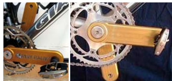
New independent geared bike crank

Utas academic staff from Human Life Science in conjunction with TIS sports scientists, have put the theory to the test. A group of well-trained riders were recruited and put through their paces three times per week for six weeks either training with the new cycling gizmo or with a normal crank set up. A comparison of peak power output and race performance was used to determine the effectiveness of the new training device.